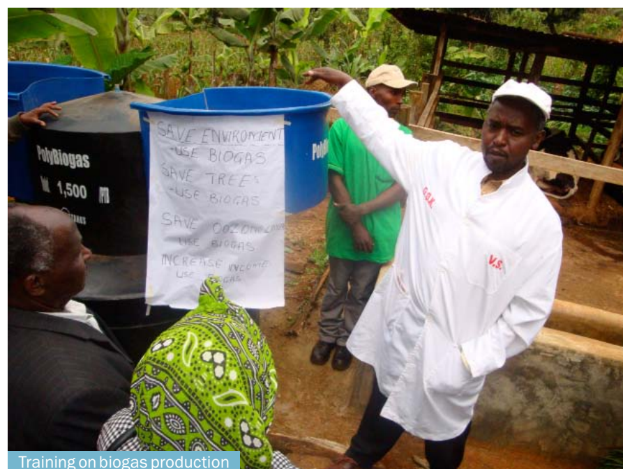
Training on biogas production

The manual was produced in close association with Rainforest Alliance and FLO-CERT as part of a project funded by the ITC.