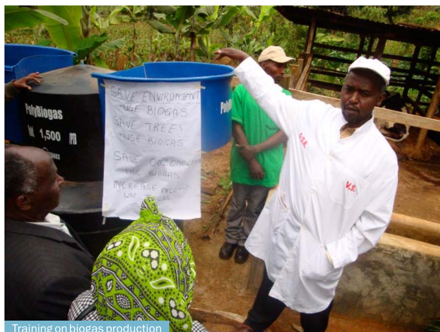
Training on biogas production

The manual was produced in close association with Rainforest Alliance and FLO-CERT as part of a project funded by the ITC.