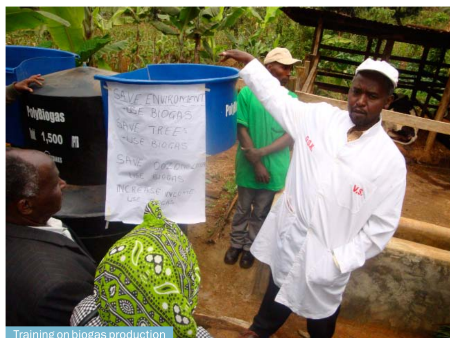
Training on biogas production

The manual was produced in close association with Rainforest Alliance and FLO-CERT as part of a project funded by the ITC.