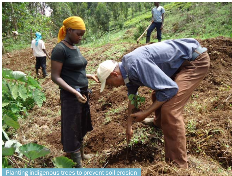
Planting indigenous trees to prevent soil erosion

In recognition of the project's overall success our work has won two awards. The first was the Marks and