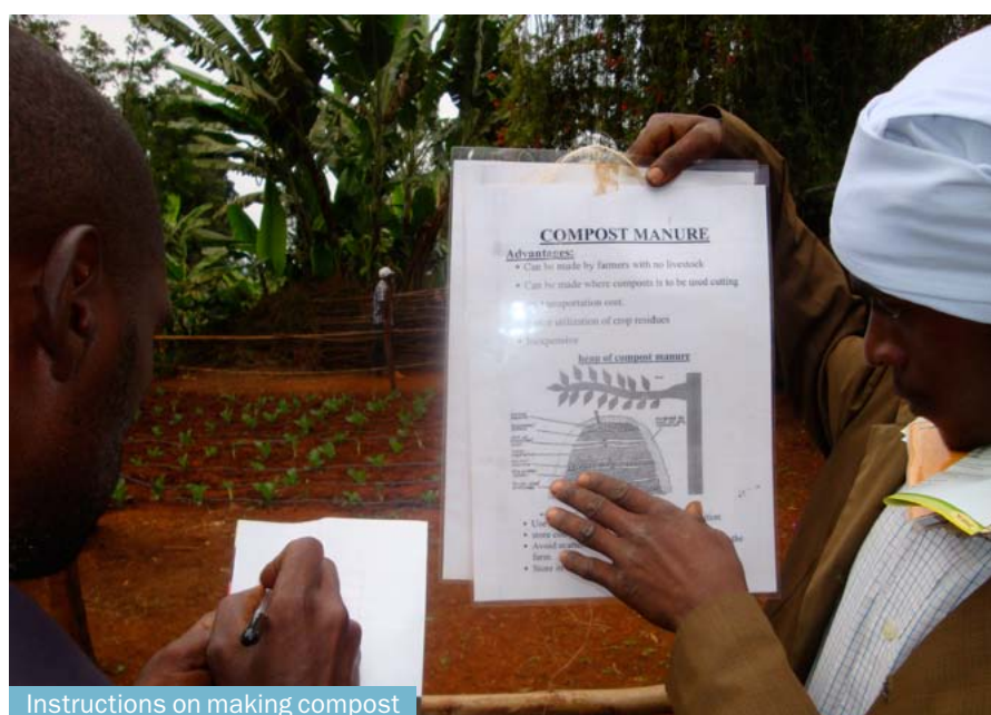
Instructions on making compost

In Uganda, the International Trade Centre is funding a climate change adaptation and mitigation training workshop for four key producer groups in Uganda. The workshop will focus on energy efficiency and mitigation measures for factories and adaptation techniques to help smallholder farmers.