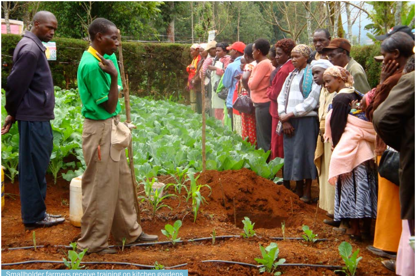
Smallholder farmers receive training on kitchen gardens

Smallholder farmers are particularly vulnerable because they have less money to spend on adaptation measures including more resistant tea clones, input materials like fertilisers and pesticides, and water management practices such as water harvesting and drip irrigation systems.