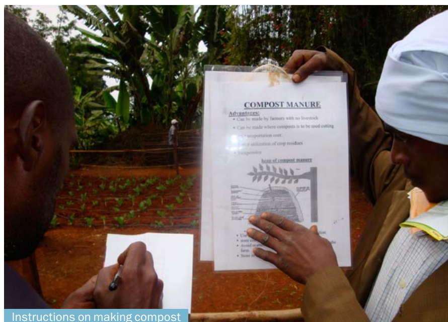
Instructions on making compost

In Uganda, the International Trade Centre is funding a climate change adaptation and mitigation training workshop for four key producer groups in Uganda. The workshop will focus on energy efficiency and mitigation measures for factories and adaptation techniques to help smallholder farmers.